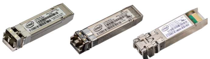
Intel® Ethernet SFP28 Optics (SR, and SR and LR extended temp)