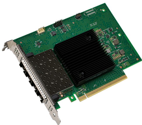
E810-XXVDA4 (Also available in low profile)

Intel® Ethernet Optics, and specification-compliant Active Optical Cables and Direct Attach Cables, can support multiple configurations.